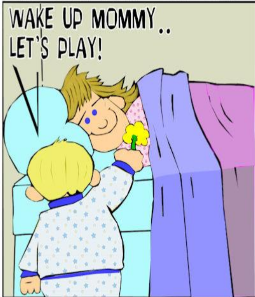
This is the day the Lord has made.. so get up mommy so we can play. Ps 118:24